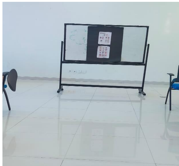
Figure 4.1 Flip Chart

Based on the observations 1, 2, and 3 the researcher found that the tutor arranged the position of the flip chart so that it can be seen by all students. The tutor placed the flip chart in front and in the middle so that all students can see the pictures and writing on the flip chart. After that the tutor also asked students whether the students could see the flip chart in front of them. In the first observation, the tutor used a big flip chart and placed it in front or in the middle between students. While in the second and third observations, the tutor used a small or mini flip chart which was then distributed to each student.