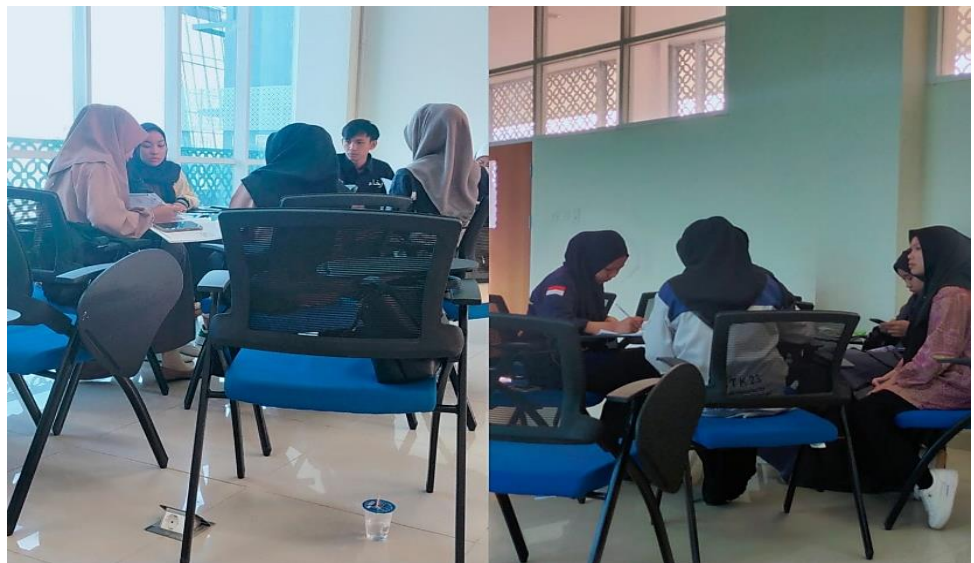
Figure 4.3 Form the position

1, 2, and 3. Then, the tutor divided the students into 2 groups, then asked the students to form a small circle, so the tutor did not ask students to form a semicircle or U position, the tutor only asked students to form a small circle position. This is because this position is the best position for students and all students can see the flip chart media.