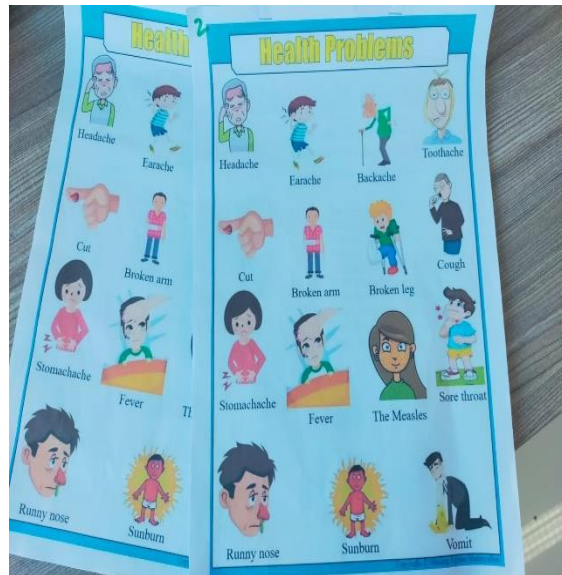
Figure 4.2 Mini Flip chart

Based on the figure above, it shows that during the first observation, the tutor used a big flip chart. And the flip chart is placed in front of the class or in the middle of the class so that all students can see it.