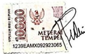
Tri Utami Putri