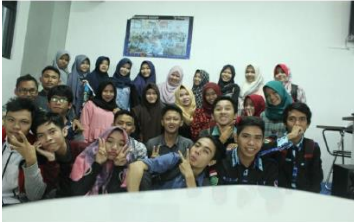
(Posing with an Extensive Reading class)

The last I say that even in the unexpected situation, we have to think creatively to reach unbelievable results like my students and I did in our online course. You have to remember that we as teachers who will make a difference in our classroom by what we have done in our ways. We have to fight against whatever situations that we face to have the best results in the teaching and learning and to make a better future for the students.