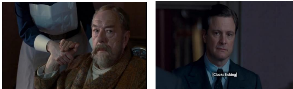
Picture 4.5 The Unspoken Shift of Power

Another example can be seen from minute 40:17 to 41:27. In the second image, Prince Albert (played by Colin Firth) was shown with a tense facial expression and a blank, distant gaze. His rigid posture and the dim lighting further emphasized the psychological pressure he was experiencing, likely in anticipation of a public speech, something he deeply feared due to