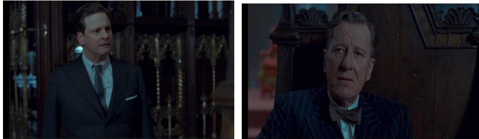
Picture 4. 3 King George VI Reacts to Lionel Logue's Bold Gesture.

In contrast, at 1.27.28 to 1.28.26, the therapy sessions with Lionel Logue often featured a more casual and sometimes humorous tone, highlighting the difference in their social statuses and the relaxed nature of Logue's approach. A key example occurred when Logue challenged the king by sitting on the royal throne: