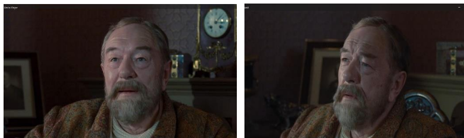
Picture 4.2 Depiction of King George V's Frailty: Reduced Vocal Clarity Reflecting His Weakening Condition.

However, there was one moment in the movie when the clarity of pronunciation and articulation was not so audible, specifically between minute 40:17 and 41:27, which was when King George V spoke. Since his character was portrayed as an old and sick man, his voice sounded slower