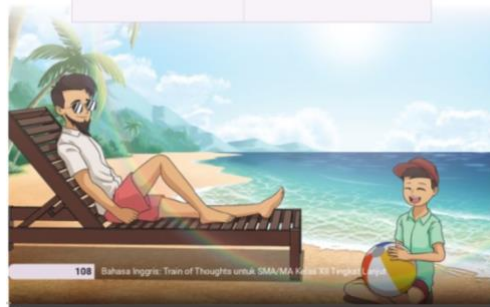
Figure 4. 2 Exercise

The integration of prominent Indonesian tourist destinations such as Lombok, Akban Beach in Sulawesi, and Raja Ampat into textbook exercises contributes meaningfully to students' cultural and environmental literacy. Including such locations in educational materials allows students to engage with real-world cultural and ecological contexts, thereby enhancing their understanding of Indonesia's geographic diversity and environmental richness. When students encounter these places in classroom activities, it fosters awareness of ecological preservation and introduces them to the importance of protecting natural resources.