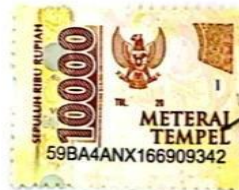
Elwana Setita Kinanti