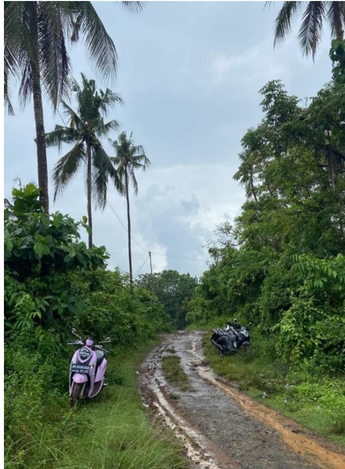
Figure 4.5 Road Conditions

"I have attended training before, but not often, because the location is far away. It is difficult to join training programs because the distance between the school and the training location is relatively far."