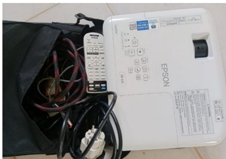
Figure 4.3 Unused LCD Projector

"Actually, the school has an LCD projector, but it is kept in the office and has never been used in my class. I have never used it during English lessons because it is not prepared for classroom use. Usually, I just teach using the whiteboard and the textbook. If I need additional materials, I write them manually on the board or prepare simple printed worksheets. Since the projector is not easily accessible and there is no clear instruction about using it, I prefer to use whatever is directly available in the classroom."