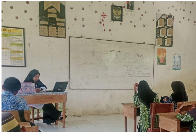
Figure 4.1 Whiteboard in the Classroom

"Because the school is in a remote area, the teaching materials are limited and tend to be repetitive, so it is difficult to vary the lessons. Sometimes I get confused about what else to use so that the students do not get bored."