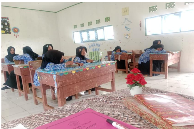
Figure 4.2 Classroom Situation

"Many students do not complete their homework. At home, they receive very little attention from their parents, so they are not guided or reminded to study. Because of that, they often come to school without finishing their assignments. In the classroom, some students also lose focus during the lesson. A few of them fall asleep, while others prefer to talk with their friends instead of paying attention. This situation makes it challenging for me to maintain students' engagement and ensure that the lesson runs effectively."