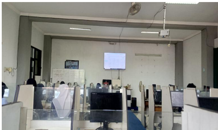
Figure 4. Technical Challenges