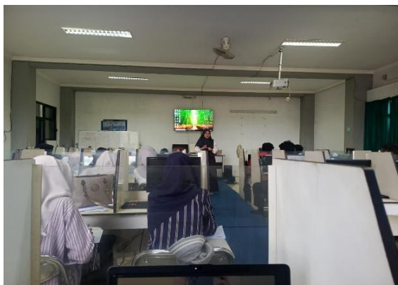
Figure 3. Lecturer explaining the material